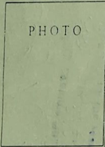
लक्ष्मी देवी मुन्डरा